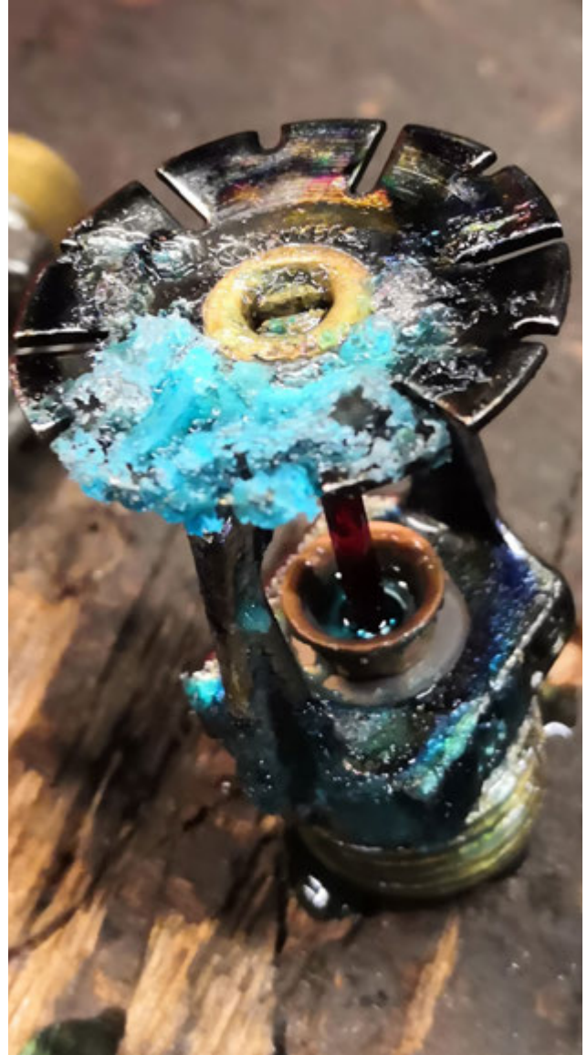
Figure 3: corrosion due to cleaning agents

Cleaning: From a food safety perspective, rooms and facilities must be cleaned regularly. Aggressive cleaning agents are often used for this purpose. The need for piping systems, including hanging and bracing, that are resistant to corrosive cleaning agents often in practice results in the application of stainless-steel pipes. It is important that the cleaning agents used are compatible with the materials used. For example, cleaning agents based on chlorides can lead to corrosion problems with stainless steel.